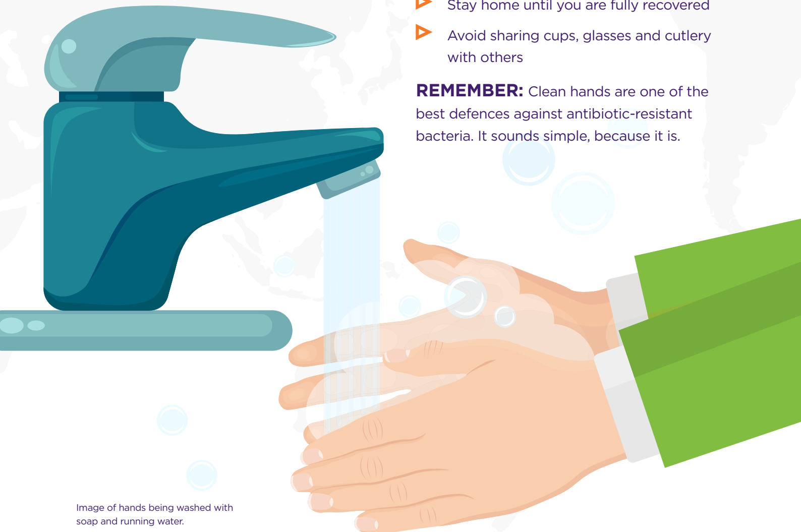
Image of hands being washed with soap and running water.

REMEMBER: Clean hands are one of the best defences against antibiotic-resistant bacteria. It sounds simple, because it is.