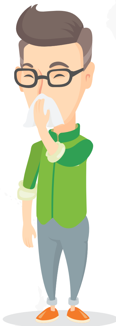
Image of man blowing his nose.