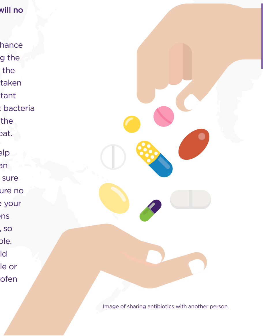
Image of sharing antibiotics with another person.

For more information on when your child might need antibiotics and when you should seek help, visit 'What every parent should know about coughs, colds, earaches and sore throats' on the NPS MedicineWise website.